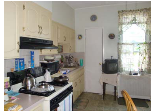
1st FI-Owner Apt: EIK w. access to yard