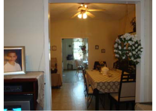
1st FI-Owner Apt: Formal Dining Room