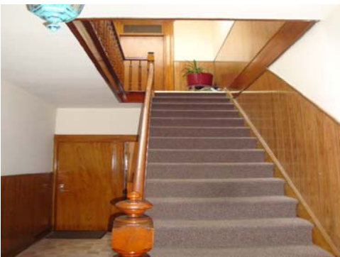
Hallway with Skylight