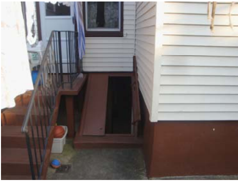
Backyard Access to Kitchen & Basement