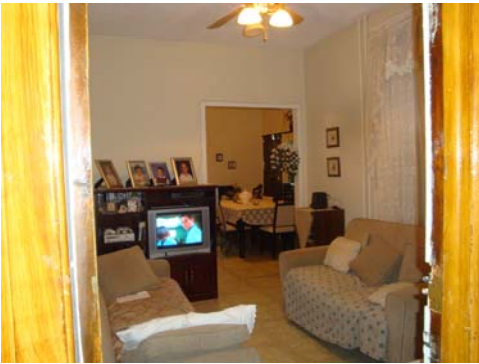
1st FI-Owner Apt: Open FDR to LR