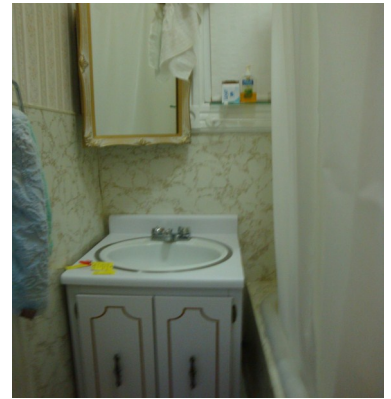
1st Floor Apartment: 5 RR Rms - Dining Rm/Living Room— 2 Bedrooms-Full Bath