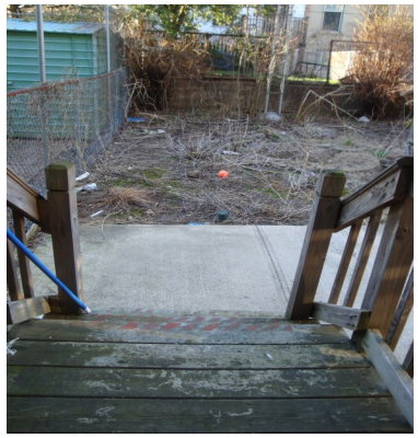
Backyard-view from 1st Fl Kitchen