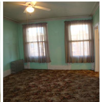
3rd Floor Apartment: 6 RR Rms-Kitchen/Dining Room & Living Room-3 BR-Full Bath