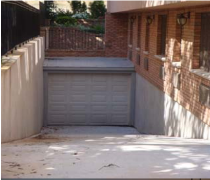
Driveway to 7 car garage-$25K per space

Laundry in Basement: 3 Washers / 3 Dryers