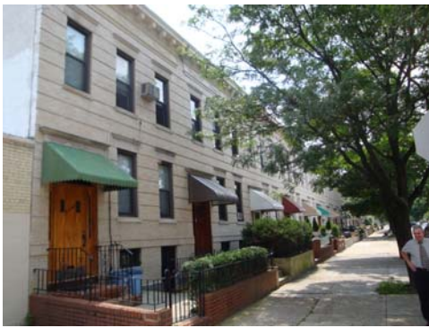
View Down the Block

Additional Pictures for 64-42 Palmetto Street Ridgewood, NY 11385