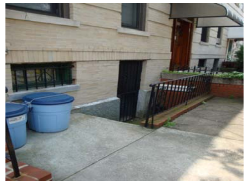
Basement Access to Front of House

Additional Pictures for 64-42 Palmetto Street Ridgewood, NY 11385