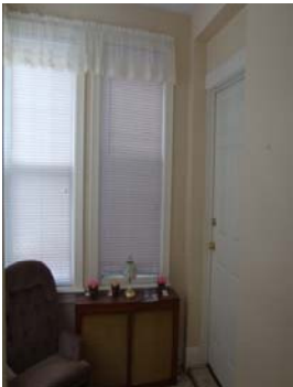
Front Foyer: 2nd FI Access