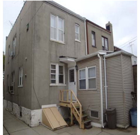
Back view of House