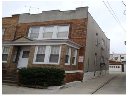
Party Driveway with 2 Car Garage