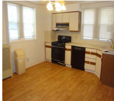
1st FI EIK