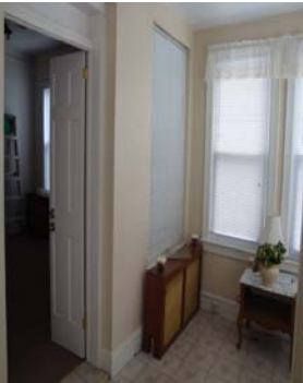
Front Foyer: 1st FI Access