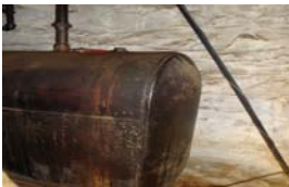
Oil Tank in Basement