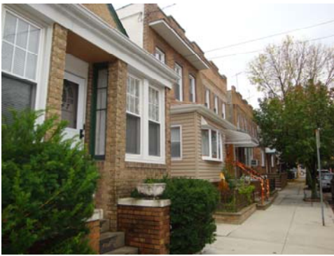
View down the tree lined block