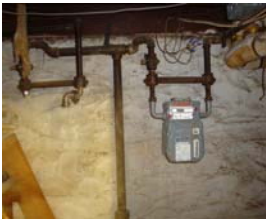
Gas Meter ( s )